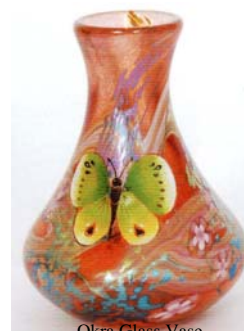
Okra Glass Vase www.okraglass.com

“The British Glass Foundation is an enabling body bringing together all relevant and independent glass and cultural organisations and private individuals, with the common aim to protect and save the glass, archive and technical collections at Broadfield House Glass Museum and to ensure their future display to the public, access for research and continued growth”.