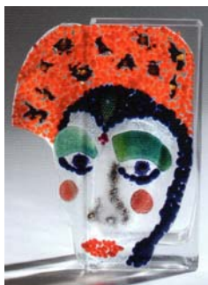
Clown Vase by Sue Purser Hope www.purserhope.co.uk