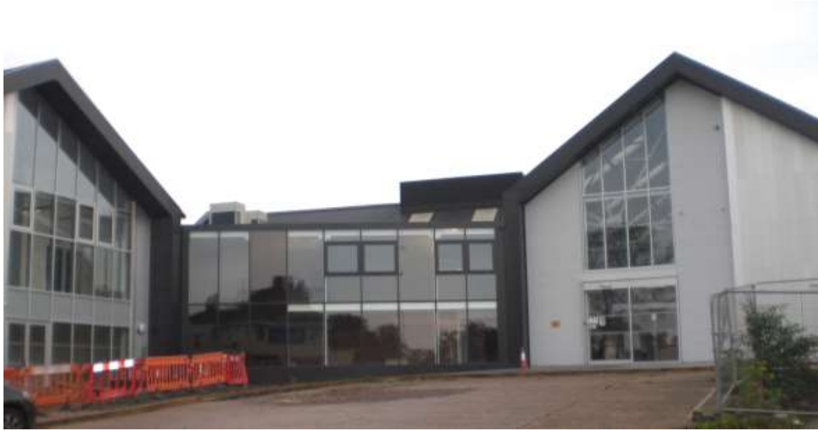
White House Cone Site – 14 October 2016

The latest imagery through the lens of BGF Secretary Lynn Boleyn MBE