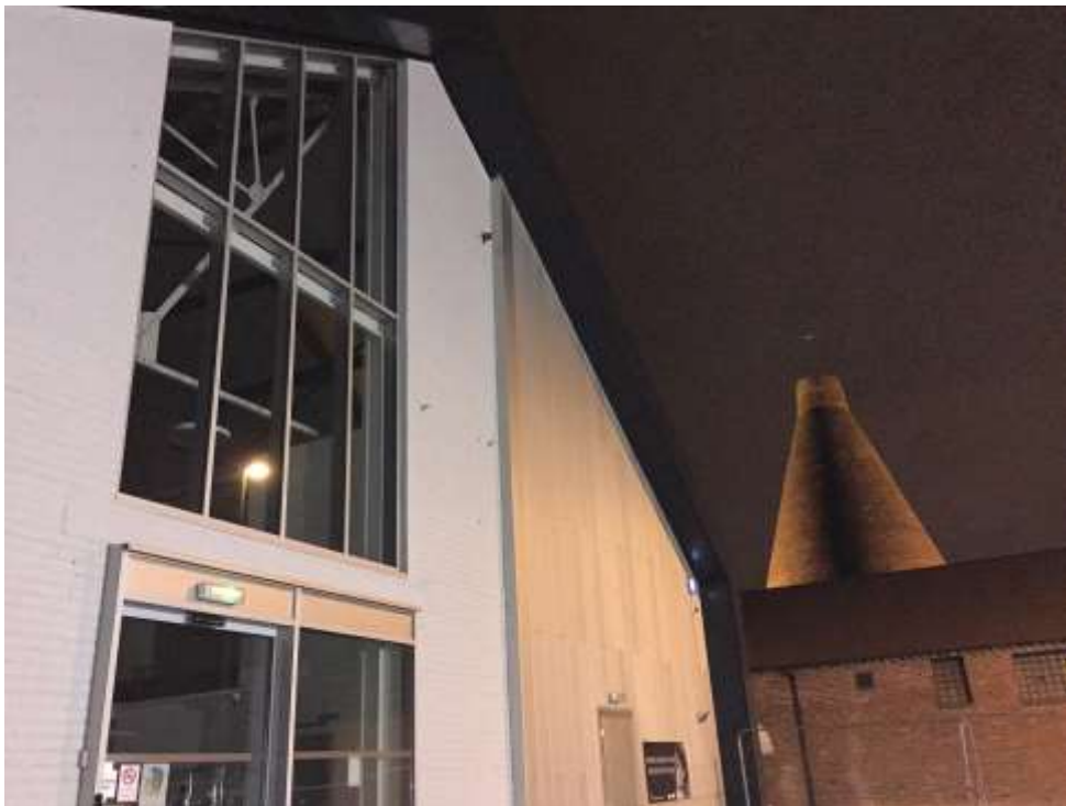
White House Cone – Museum of Glass and Red House Cone at Night 3.11.16

The latest imagery through the lens of BGF Trustee Allister Malcolm