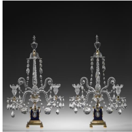
Pair of girandoles, about 1785. Probably Josiah Wedgwood & Sons Ltd. (plaques), probably England,