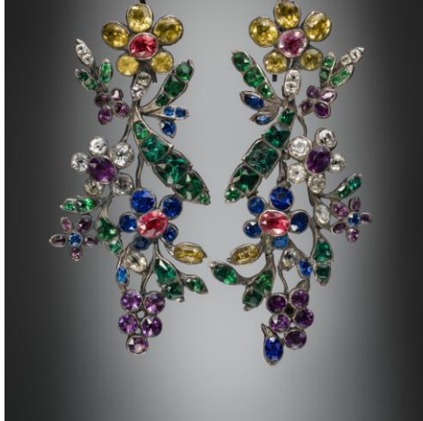
Pair of Harlequin Earrings, about 1760. Probably England. Cut glass; silver.

The latest exhibition at Corning Museum of Glass over in New York is a delightful celebration of British glass. But if you're not planning on going to the States just now you can instead enjoy the overview of In Sparkling Company: Glass and the Costs of Social Life in Britain During the 1700s here: https://whatson.cmog.org/exhibitions-galleries/sparkling-company-glass-and-costs-social-life-britain-during-1700s