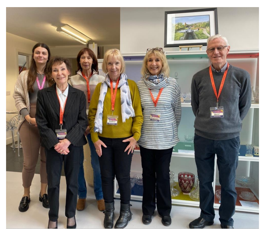
Does that hit the spot? Contact us at the usual address and we'll sort the rest.

The easiest bit is the entry qualification; quite simply, if you can say: 'Welcome to Stourbridge Glass Museum' – or even if you can't, for that matter – then we have a positive, worthwhile and fulfilling role for you in the heart of the Stourbridge Glass industry amidst one of the finest glass collections in the world. You can give us as much or as little time as you wish and we pride ourselves on our compliance with all current employment and discrimination practises.