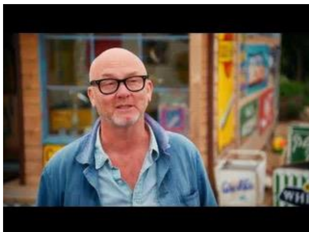
Salvage Hunters Season 17 Episode 14 | Full Episode 2023 HD youtu.be

38 minutes in Stourbridge Glass Museum gets another great bit of promotion with collection exposure and information from Keith Cummings and a glassblowing demo by the team here.