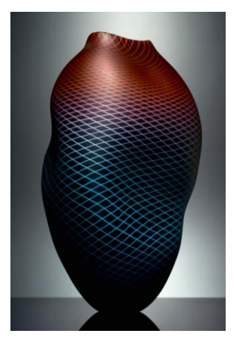
Warp/Fade by Liam Reeves