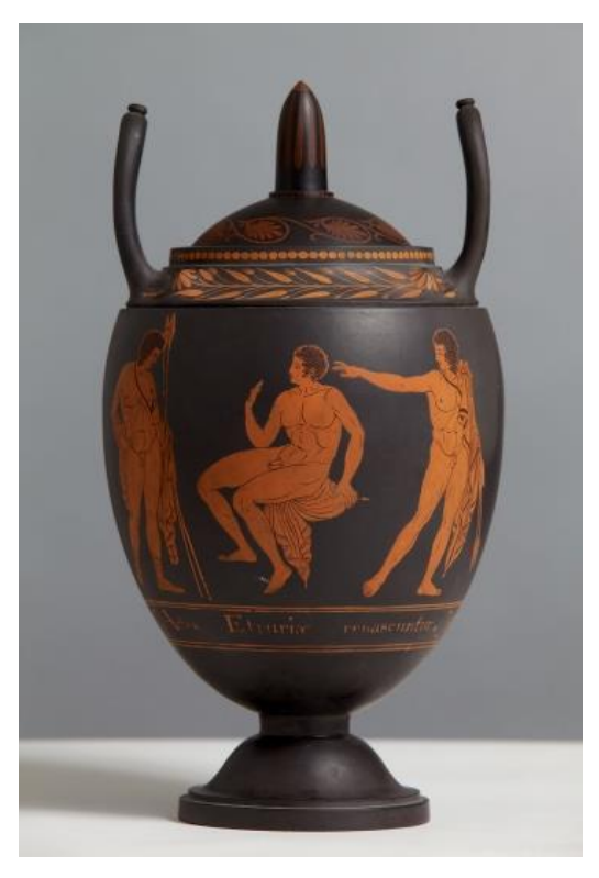
Josiah Wedgwood – The First Day's Vase c1769

Here, from the shimmering opulence that is the Editorial suite of GlassCuts Towers we continue to pride ourselves on our reputation for being objective, dispassionate and apolitical in bringing you all the news that is the news from the Wonderful World of Glass <sup>©GF</sup>