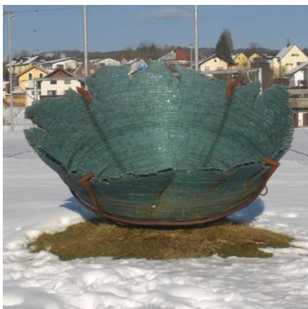
Glass Garden, Frauenau