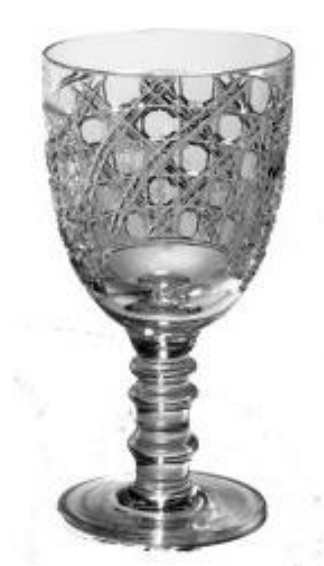
Battle of Waterloo Goblet Tudor Crystal