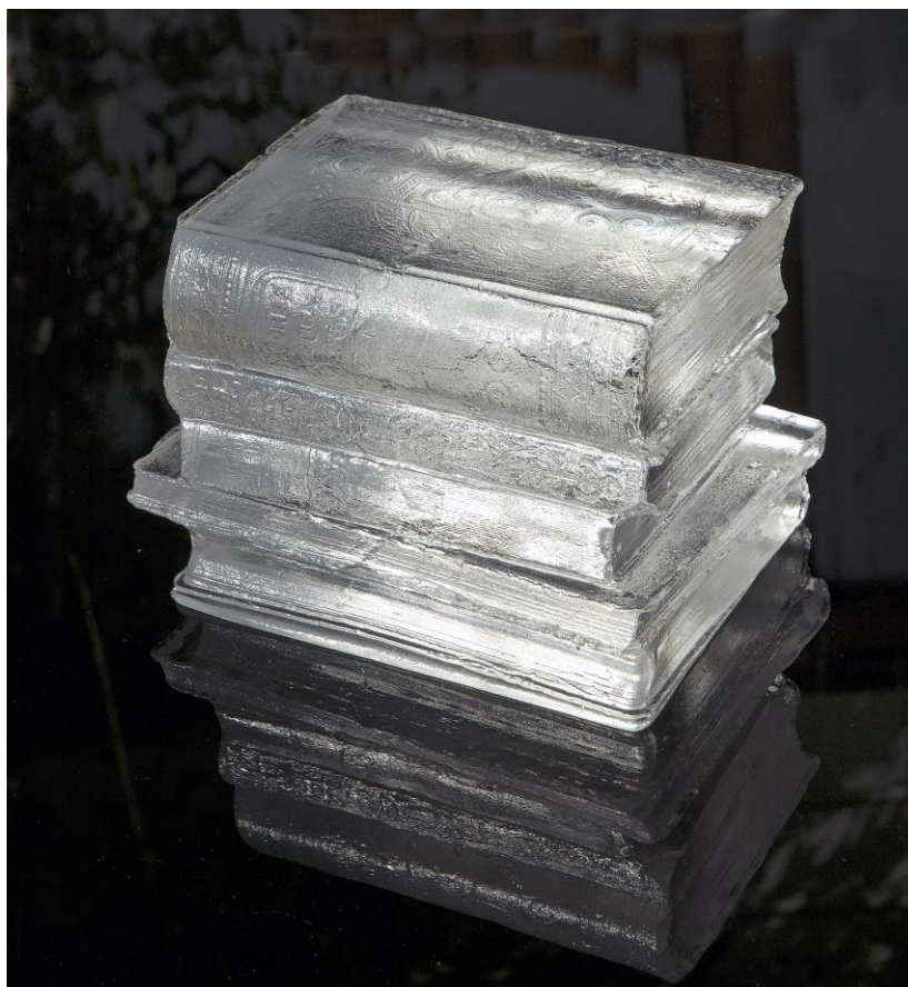
Stacked Books: Alex Archbold

Just Glass will demonstrate the beauty that can be achieved with kiln-formed glass (also known as ‘warm glass’ as opposed to ‘hot glass’ disciplines such as glass-blowing). It will feature established and emerging glass artists belonging to the Just Glass collective. Kiln-formed glass art is a beautiful medium that has aesthetic potential which is only just being explored. The artwork can be sculptural or flat, tiny or huge, with or without inclusions.