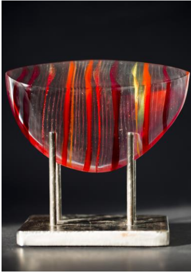
Latitude 0 by Celia Goodman