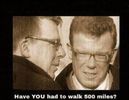
Were you advised to walk 500 mmes? You could be entitled to compensation. Call the Pro Claimers NOW.

On a brighter note, here is the latest from our legal department. Have you recently walked 500 miles? Then have you walked 500 more? Just to be the man who has walked 500 miles to fall down at someone's door? If so, you could be in line for compensation. Call Pro-Claimers now! And do try not to take it all too seriously.