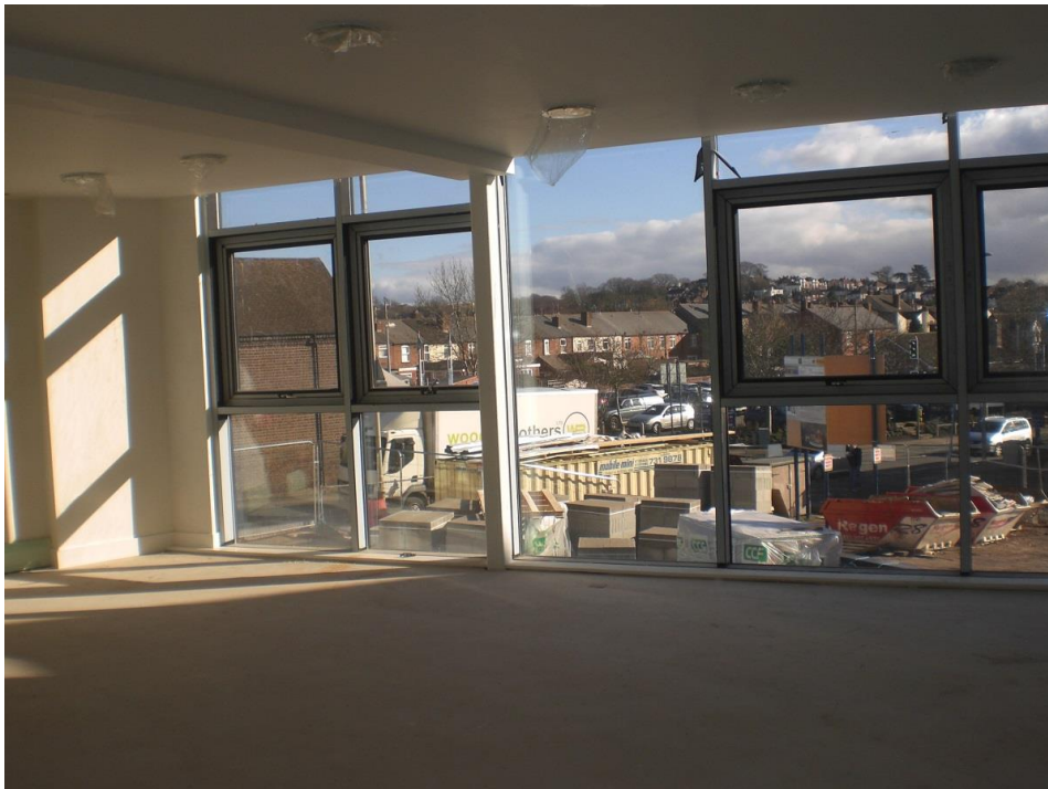
Views from inside the New Build to High Street and to Red House Cone 10.2.2016

The latest images say it all. Nearly there!