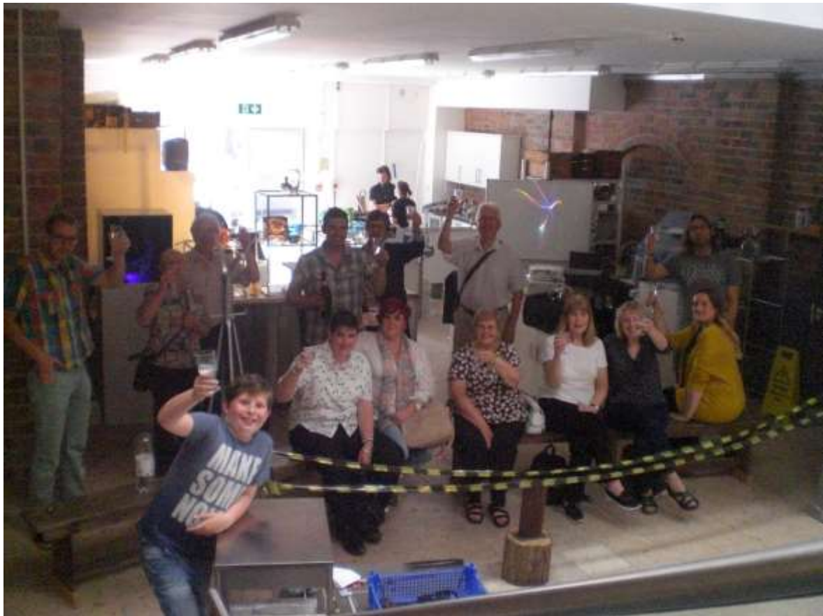
A toast to the new Hot Glass Studio at White House Cone 11 June 2016