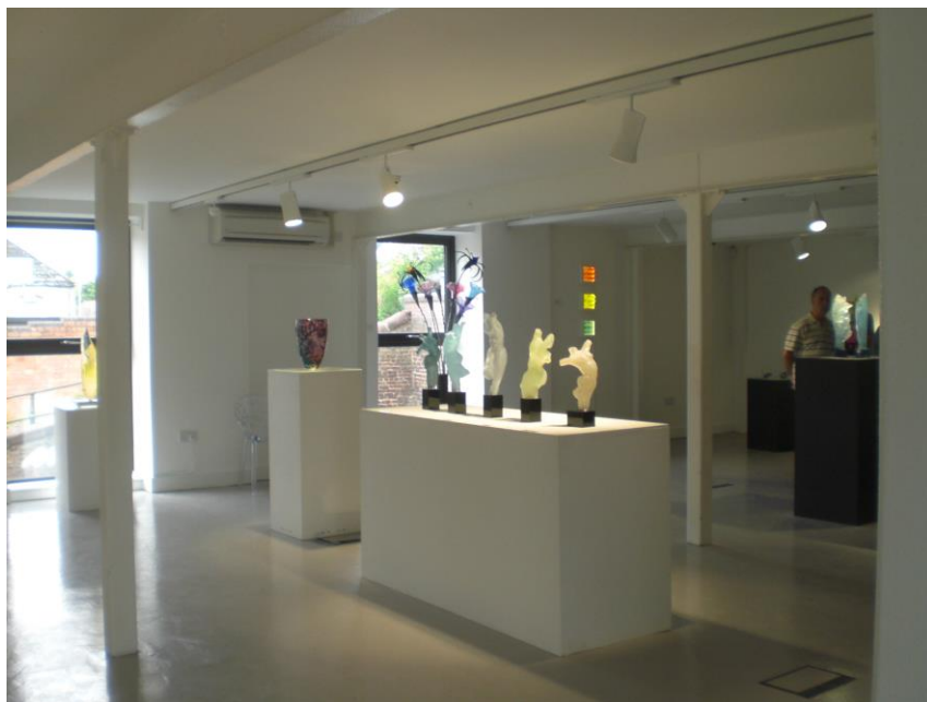
Ground Floor of new Museum

The latest imagery through the lens of BGF Secretary Lynn Boleyn MBE