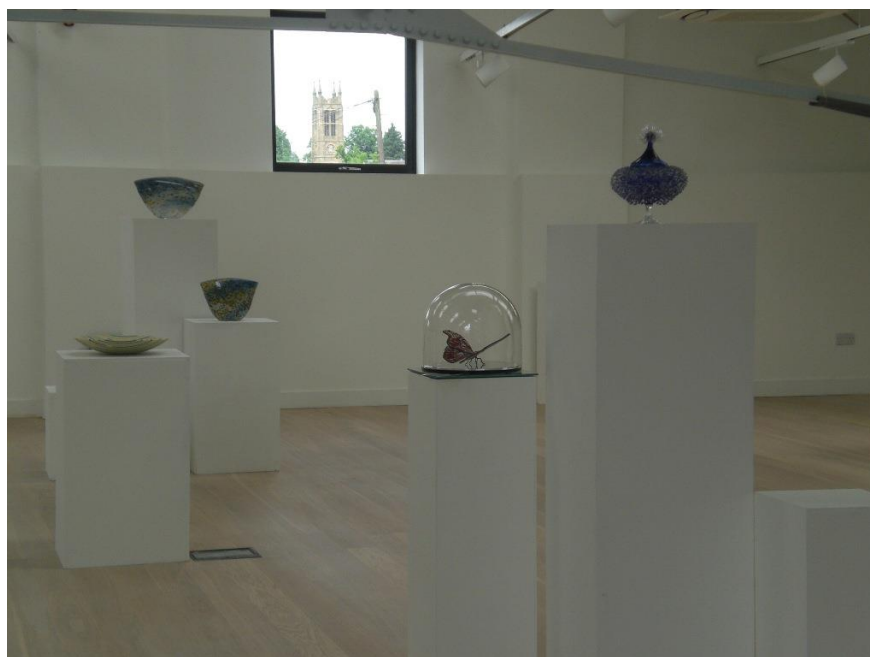
First Floor of new Museum