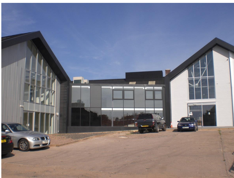
White House Cone Museum of Glass – 16 August 2016

The latest imagery through the lens of BGF Secretary Lynn Boleyn MBE