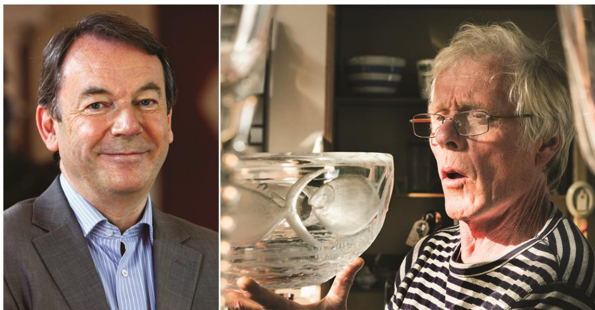
GA Charity event in aid of the White House Cone Museum of Glass & the Glass Association

Equally noteworthy but in a very different way; the Trustees of BGF are delighted to remind our readers and supporters that the Glass Association will be holding their 2016 AGM at White House Cone - museum of glass .