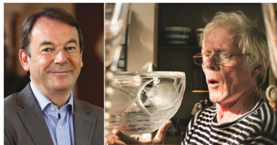
GA Charity event in aid of the White House Cone Museum of Glass & the Glass Association

Booking is essential and full details can be found either on the Glass Association website www.glassassociation.org.uk or via 0121 354 4100.