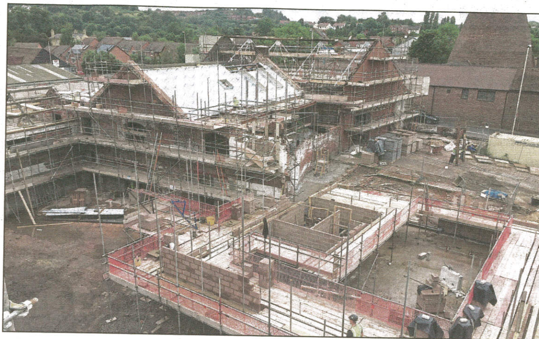
Work is underway to create the new museum on the White House Cone site in Wordsley

The new museum, which will be based opposite the historic Red House Glass Cone, will showcase the borough's glass collection in a more accessible and visitor-friendly way than is possible at Broadfield and the development will involve sympathetic restoration of the listed former Stuart Glass