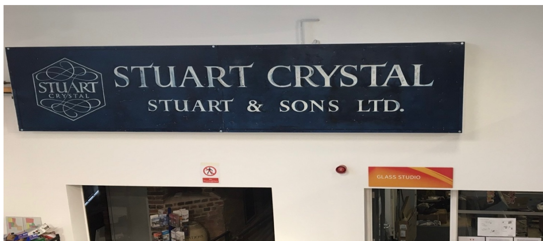
The sign that once hung outside Stuart Crystal, Wordsley that has been restored and now hangs in the foyer of Stourbridge Glass Museum, former home of the factory.

The world of Stourbridge Glass was not without its dynasties of which any student could list a veritable compendium of famous names, and, floating like cream towards the top of the mix, that of Stuart would be there or thereabouts.